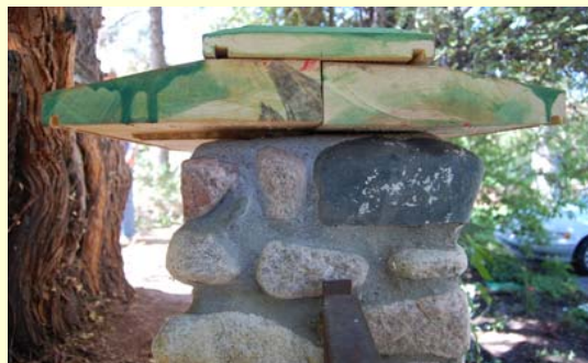
Photo of the base sill on which the posts and pickets will sit. This configuration is based on the deteriorated original structure with a single board covering the seam on the massive 22-inch sill.

As the work proceeds, we all admire the complex artistry of its anonymous original builder. "Whoever built this fence knew what they were doing" restoration specialist Charles Coffman commented as he shaped a curved rail that will be placed on the tallest section near Canyon Road. "We don't see this kind of construction in Santa Fe."