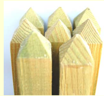
Above, close-up of the picket tops. Below, a post with Dutchman repair.

In recreating the components, hundreds of through-mortises were cut, 126 pickets, each requiring 21 cuts, were made and posts were turned and mortised. All of the wood was saturated in wood preservatives. The challenging restoration is being performed by