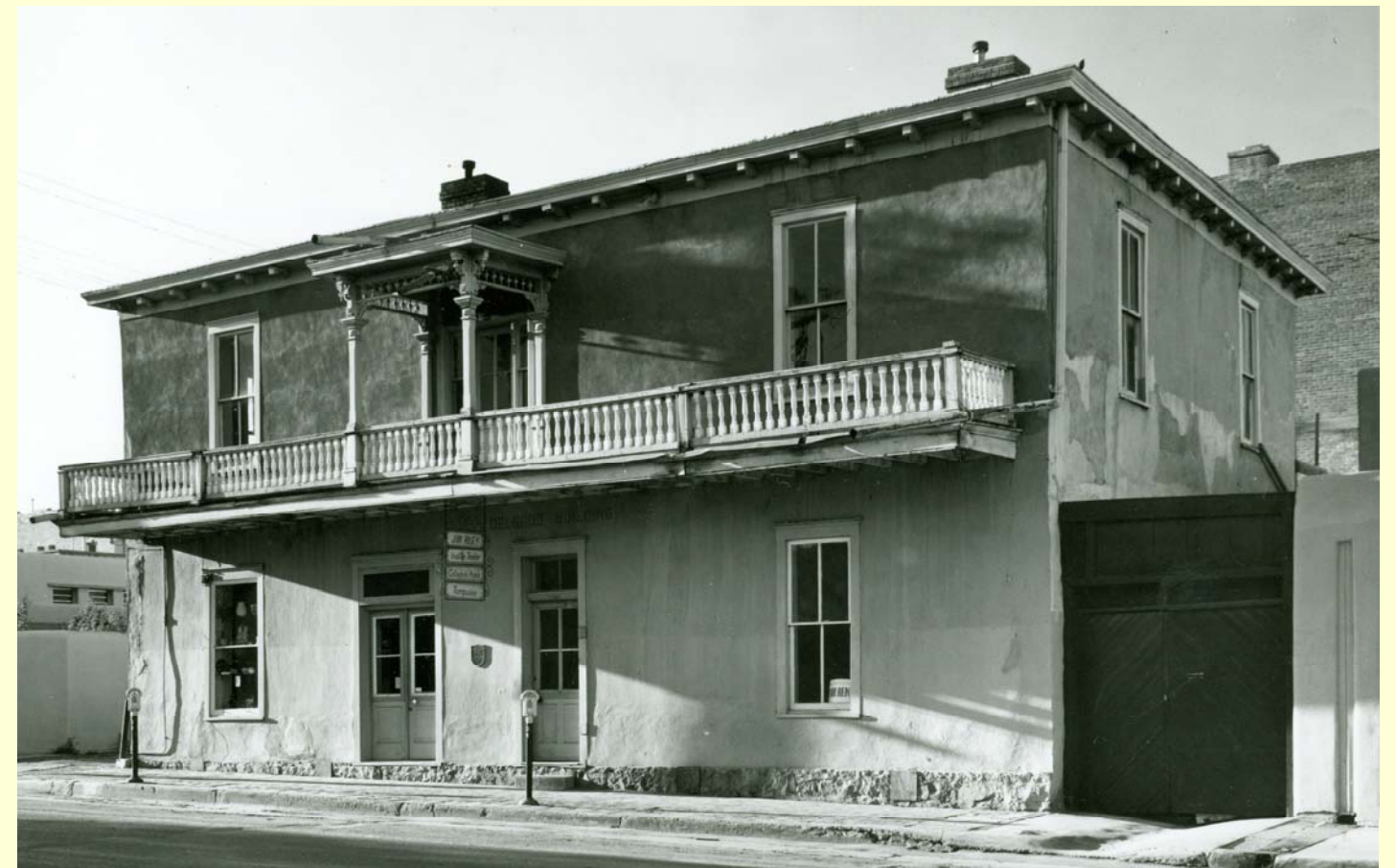
The Felipe B. Delgado House, photographed between 1962 and 1968.

Two houses owned by the Historic Santa Fe Foundation have new tenants. The S.R. Brennen Gallery has moved into the Felipe B. Delgado House at 124 West Palace Avenue, and Antiques and Interiors on Grant is now in the Oliver P. Hovey House at 136 Grant Avenue. One of our overall goals is to find compatible uses for our properties that provide reliable access to the public. How the building is used can really affect one's impression of the spaces within. There is an elegance in the Delgado House's interior that we haven't seen in many years. Even though they are quite worn, it's really wonderful to see the wood floors again. Because of the austerity of the interior furnishings, the eight fireplaces, which are slightly different in each room, are visible.