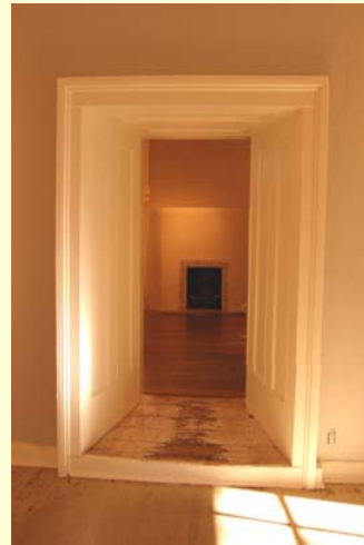
Note the thickness of this interior wall at the Hovey House.

In the circa 1891 Delgado House, we removed carpeting to expose the wood floors. Fluorescent lighting and shelving, installed by the previous tenant, was removed. We performed carpentry repair,