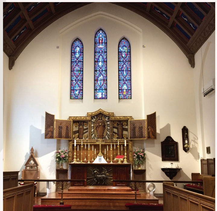
Altar at the Church of the Holy Faith

the area and then utilize this recognition for further education through events, tours, articles, or lectures. In reaching outside of the historic districts, we will help illuminate a larger history than visitors to the city might normally encounter. That, we think, is a very worthy endeavor, and one that takes the original purpose of this great Foundation to another level of participation and relevance in the community. In an introductory section to OSFT , 4th edition, titled 'Plaquing Santa Fe Historic Property', it states that "The plaquing of buildings that have been found to be of historic importance is central to the Foundation's mission of increasing public awareness of Santa Fe's heritage." We believe that in 2019, as we enter our 58th year of existence, that sensibility is more important than ever, and we will endeavor to present a cultural and architectural heritage that is diverse and inclusive of all areas of the city.