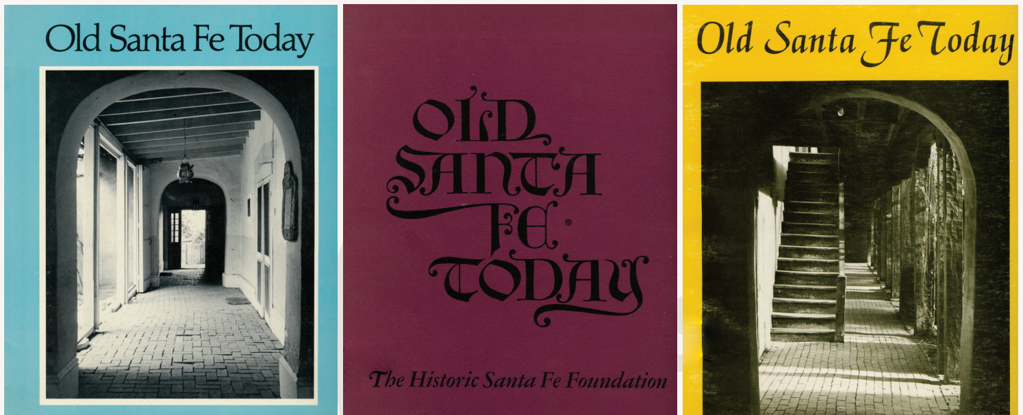
Old Santa Fe Today editions from left to right: second, 1982; first, 1966; and third, 1972.