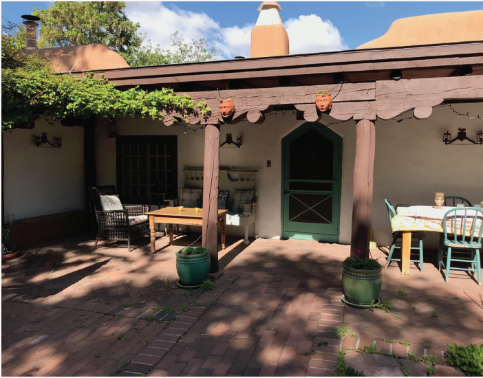
The Arthur Boyle House