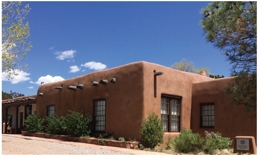
Spanish Colonial Museum, aka The Laboratory of Anthropology, photo by Melanie McWhorter

Historic Santa Fe Foundation 545 Canyon Road Suite 2 Santa Fe, NM 87501 info@historicsantafe.org historicsantafe.org 505.983.2567