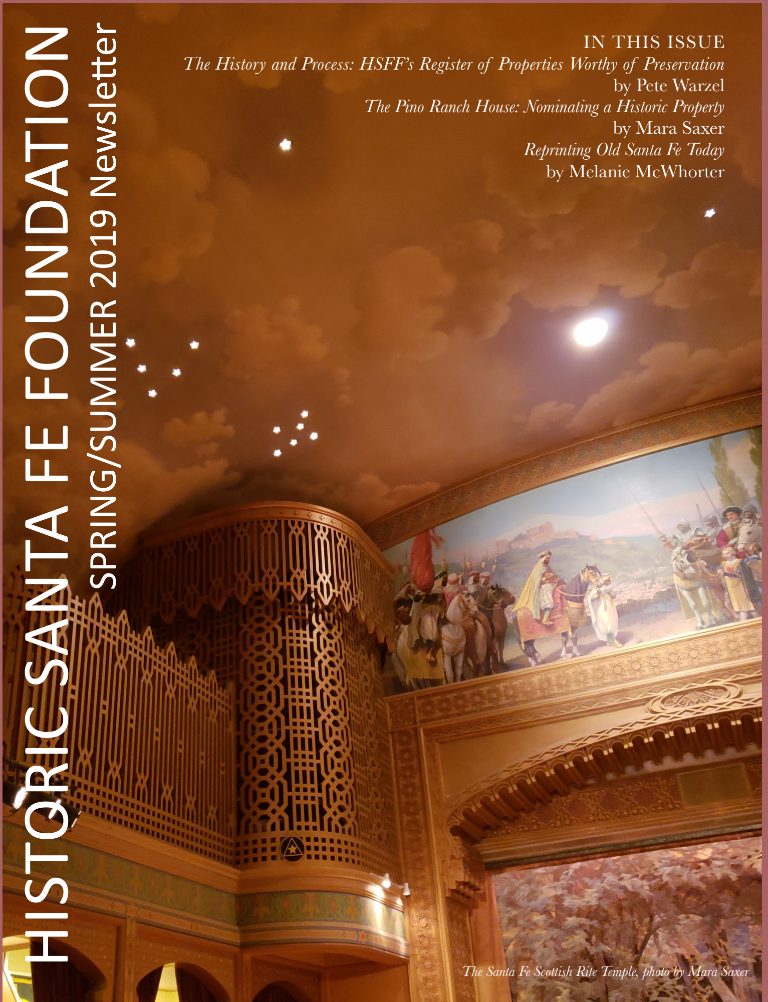
The Santa Fe Scottish Rite Temple