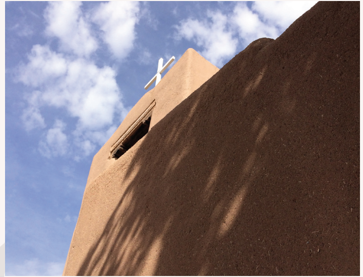
San Miguel Chapel

lished by the then School of American Research, the number of properties included was thirty-three, but only sixteen of those were sporting a plaque on the Register. Today we have an even 100.