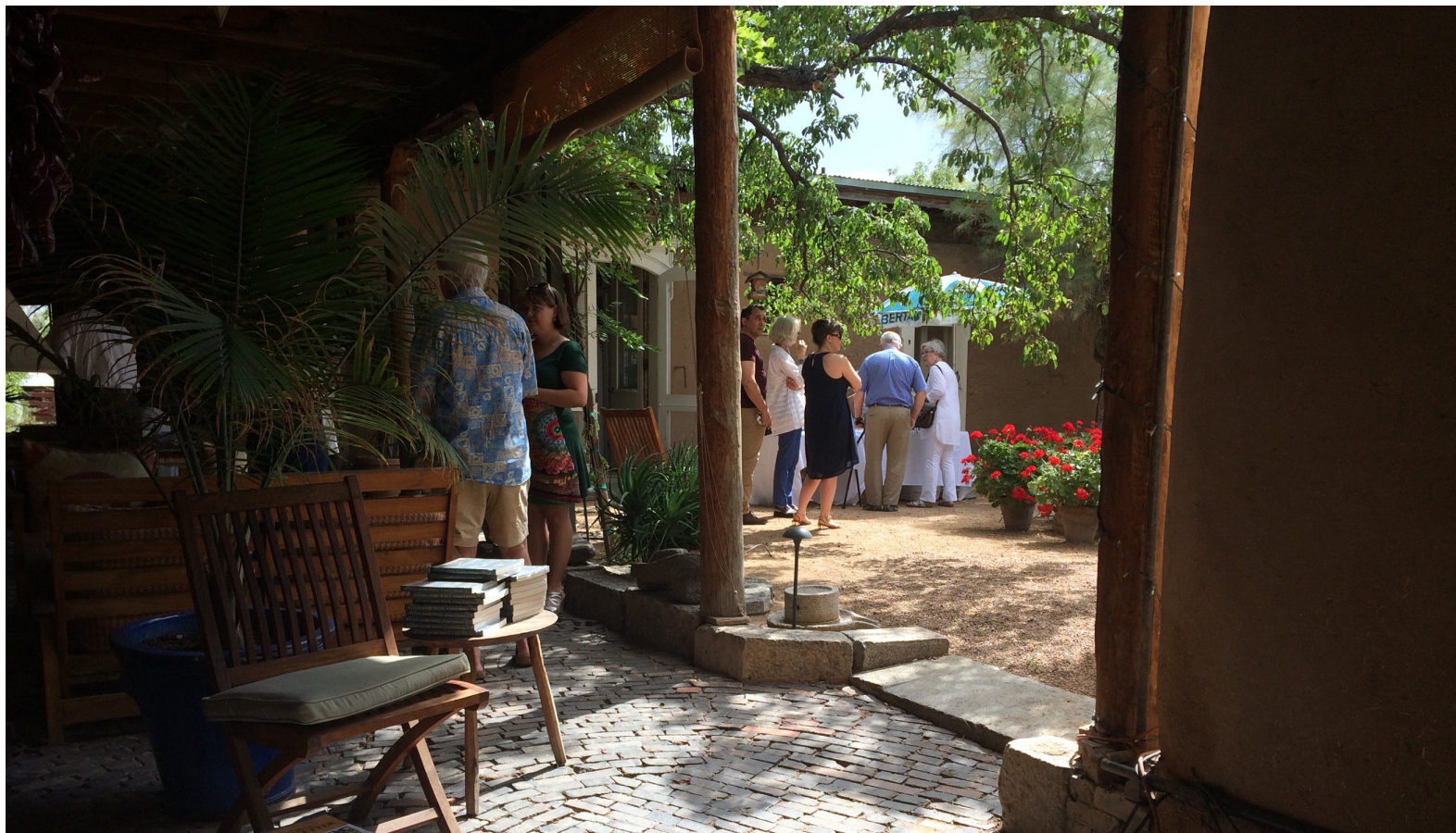
Image above, HSFF Stewards gathered in the courtyard of the Donaciano Vigil House in summer 2016