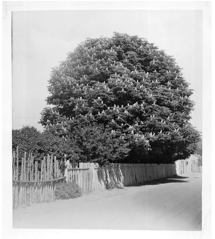
All images from HSFF archives. Title image courtesy Museum of New Mexico, neg. 31821. El Zaguán by Laura Gilpin.