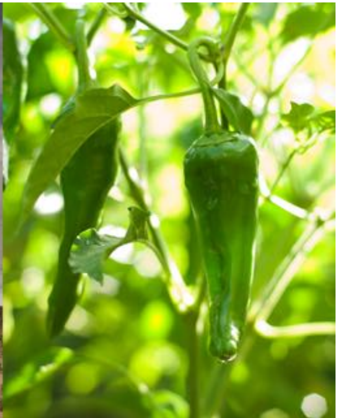
A storm cloud pours down rain over Santa Fe mid-summer during "monsoon" season, while a maturing chile pepper shows rain drops after a downpour.