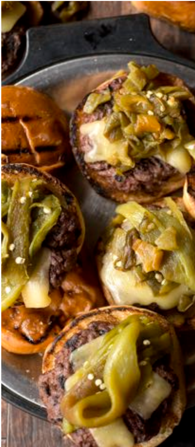
Green Chile Cheesburgers from Farm Fresh Journey