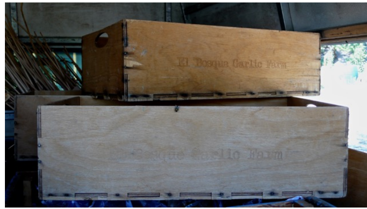
Bosque Farms Garlic Boxes