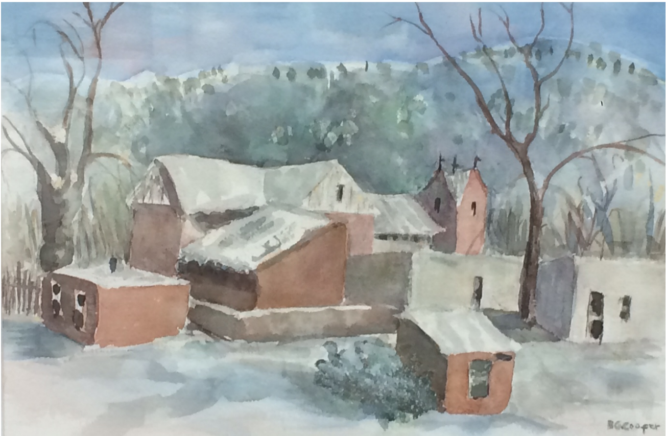
Chimayo in Winter ©Blair Cooper from the exhibition Pushing the Boundaries: Water and Color in New Mexico on display at HSFF until September 29, 2017

Price per person of this exclusive tour and dinner is $175 per person through the HSFF offices. Reservations are required, limited to 26 individuals and will be filled on first come, first serve basis until full. Final deadline for reservations is Friday, September 29, 2017 at 1pm or until full. Call Melanie McWhorter at 505.983.2567, email Melanie@historicsantafe.org or visit www.historicsantafe.org/chimayotour