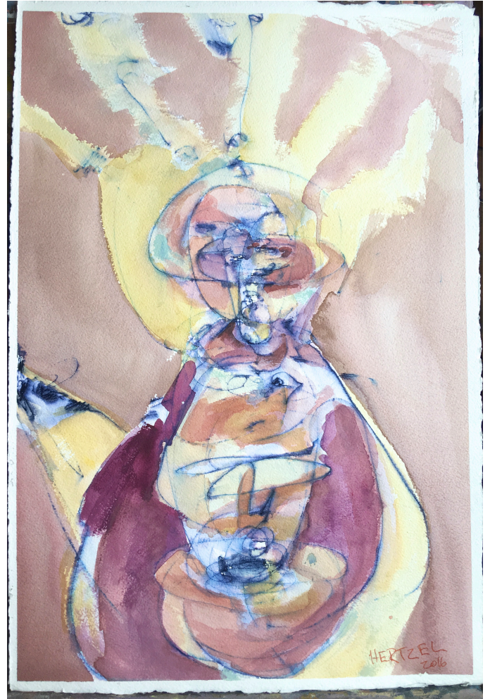
Jean Baptiste ©Jonathan Hertzell from the exhibition Pushing the Boundaries: Water and Color in New Mexico

HSFF also supports artists from the larger community and works with some of our partners to curate exhibitions related to the founding and history of our great city. In July 2017, HSFF, in partnership with artist and art conservator Bettina Raphael, announced the annual call for entries for the watercolor show. HSFF decided to expand the accepted entries to include media not only in watercolor, but gouache, acrylic paint and water-based ink. This year's theme and exhibition title is Pushing the Boundaries: Water and Color in New Mexico and includes works by 33 artists, most of whom reside in Santa Fe or Northern New Mexico. The works vary from traditional watercolors of adobe houses on paper and Southwestern landscapes to minimalist and abstract acrylic on canvas and wood.