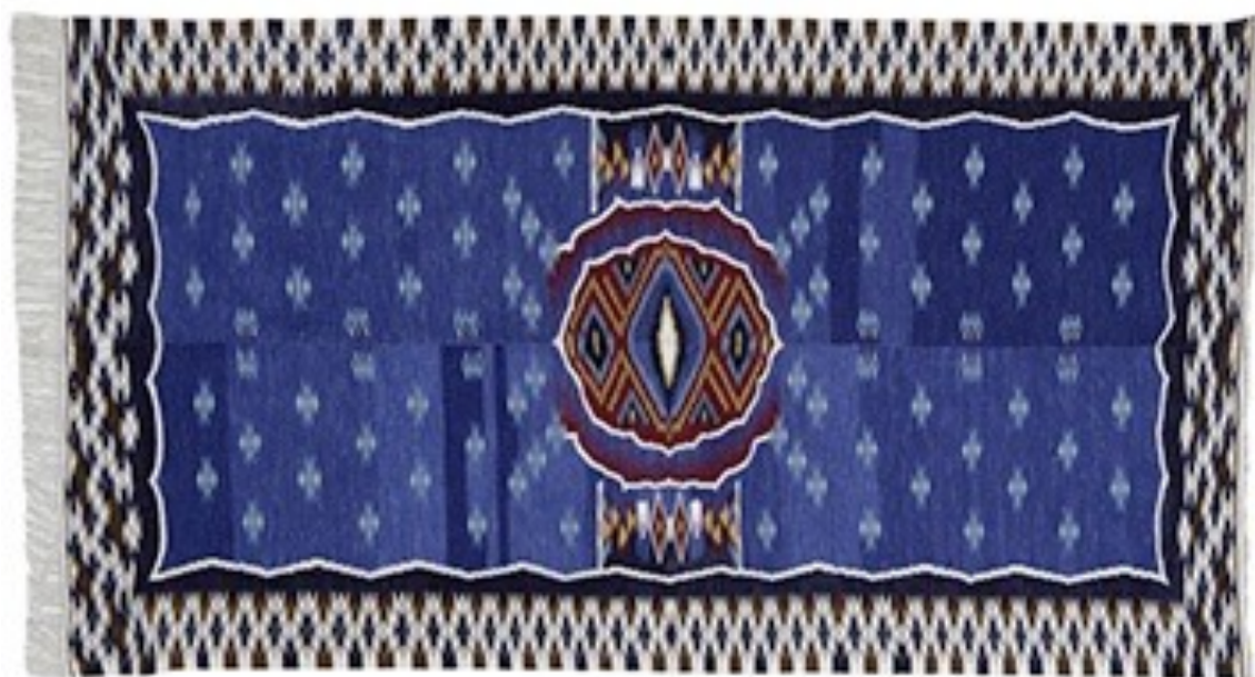
Emergence 48x84, Irvin Trujillo Merino wool silk