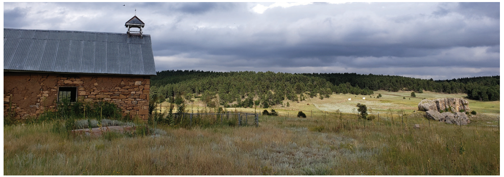
San Isidro, Sapello