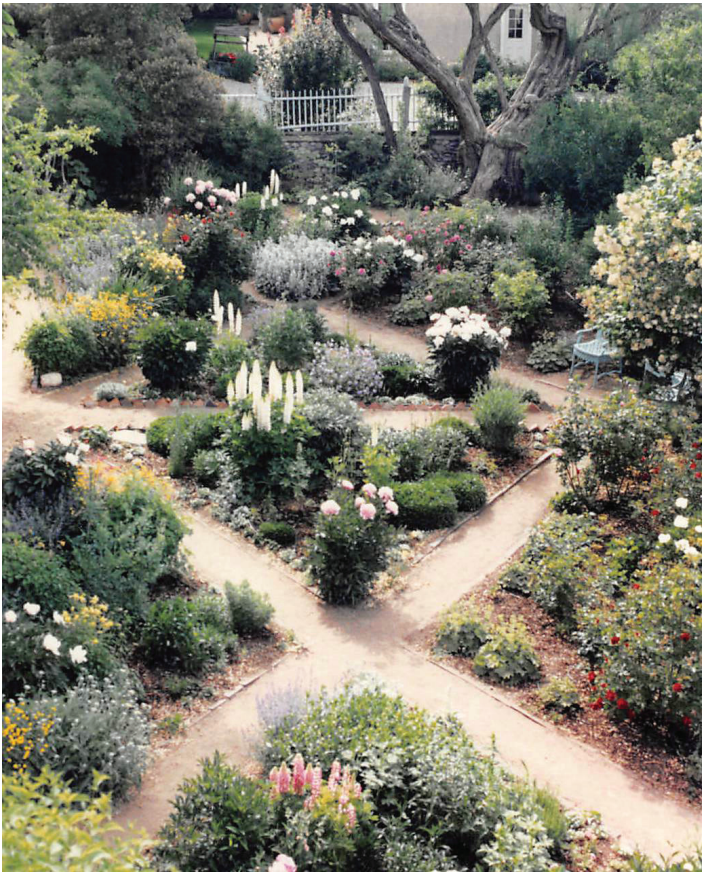
El Zaguán garden

tion in the apartments and current office/public space are under consideration to reflect the best use of the property going forward. This must entail a budget(s) and capital plan for the transition over time.