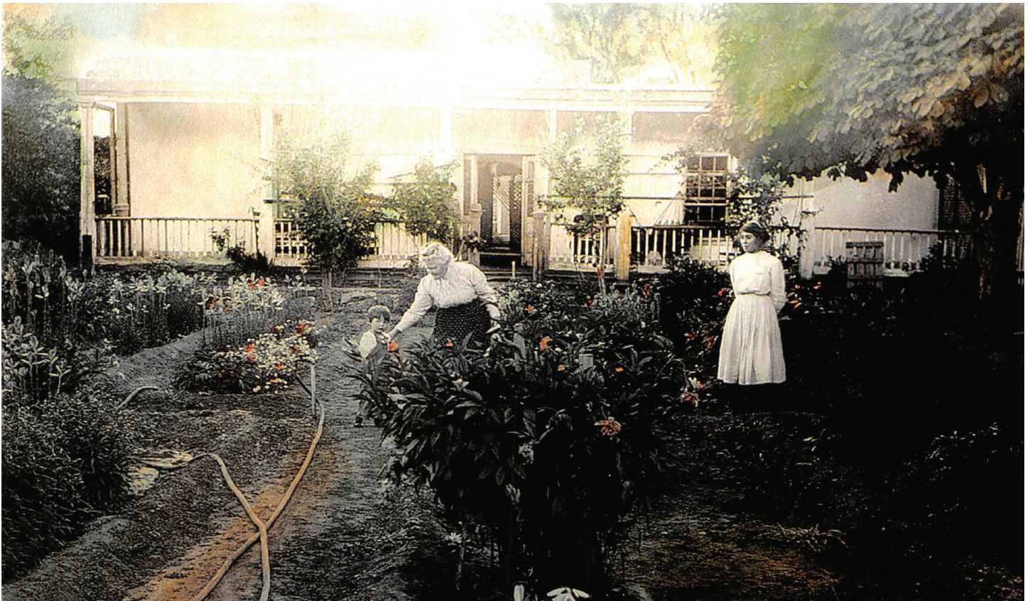
El Zaguán garden from the HSFF archives

tee each contributed valuable input or written reports which served the purpose of coordinating the master planning effort among the Foundation's other committees and made sure more voices were heard.