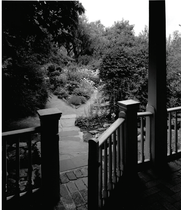
El Zaguán garden