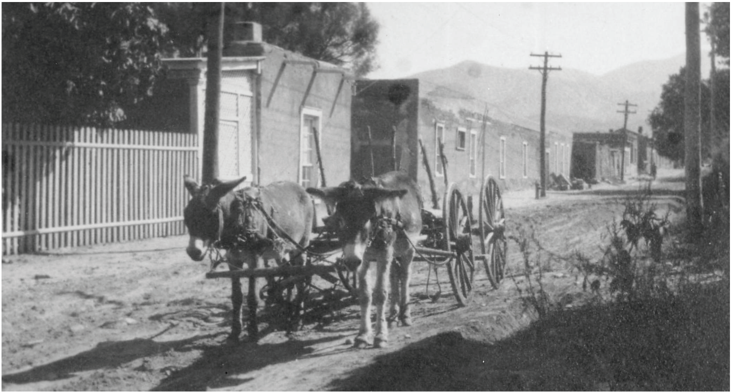
El Zaguán from Canyon Road

tivity, maintain financial viability, and further the outreach of HSF through El Zaguán.