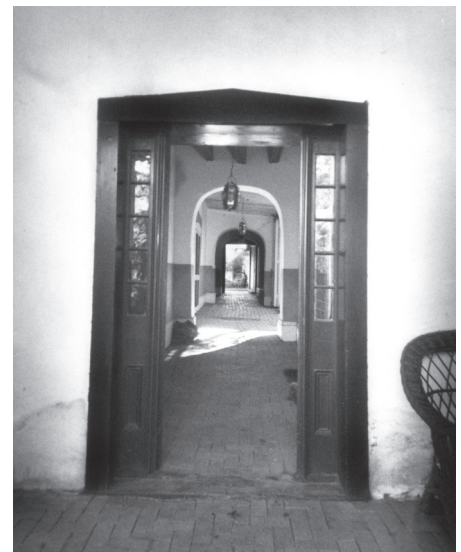
El Zaguán

A guiding principle of the El Zaguán Master Plan is a recommendation that all character-defining features should be diligently