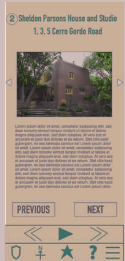
Top: Cover of Old Santa Fe Today , 5th edition. Bottom: App mock-ups by Digital Ant Media