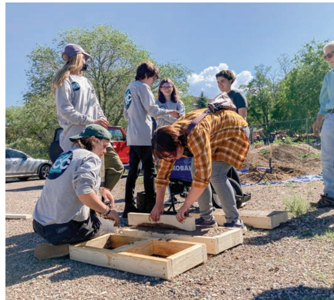
Photographs of Youth Conservation Corps/Santa Fe Children’s Museum youth program

HSFF is excited to announce a fellowship for high school juniors and seniors. The HSFF High School Fellowship was established for the purpose of encouraging local high school upperclassmen to engage with Santa Fe’s history and present-day preservation efforts and provides Fellows the opportunity to examine Santa Fe’s history and related contemporary issues with local historians, archeologists, and preservation trades professionals. Participating students will spend the academic year 2023-2024 meeting in historic properties across Santa Fe where they will take part in discussions on history while working on a research paper. Upon successful completion of their responsibilities, Fellows will be awarded a sum of $500 for college tuition. Applications for the inaugural group of Fellows is now open. High school juniors and seniors are encouraged to apply. More information available at historicsantafe.org/hs-fellowship