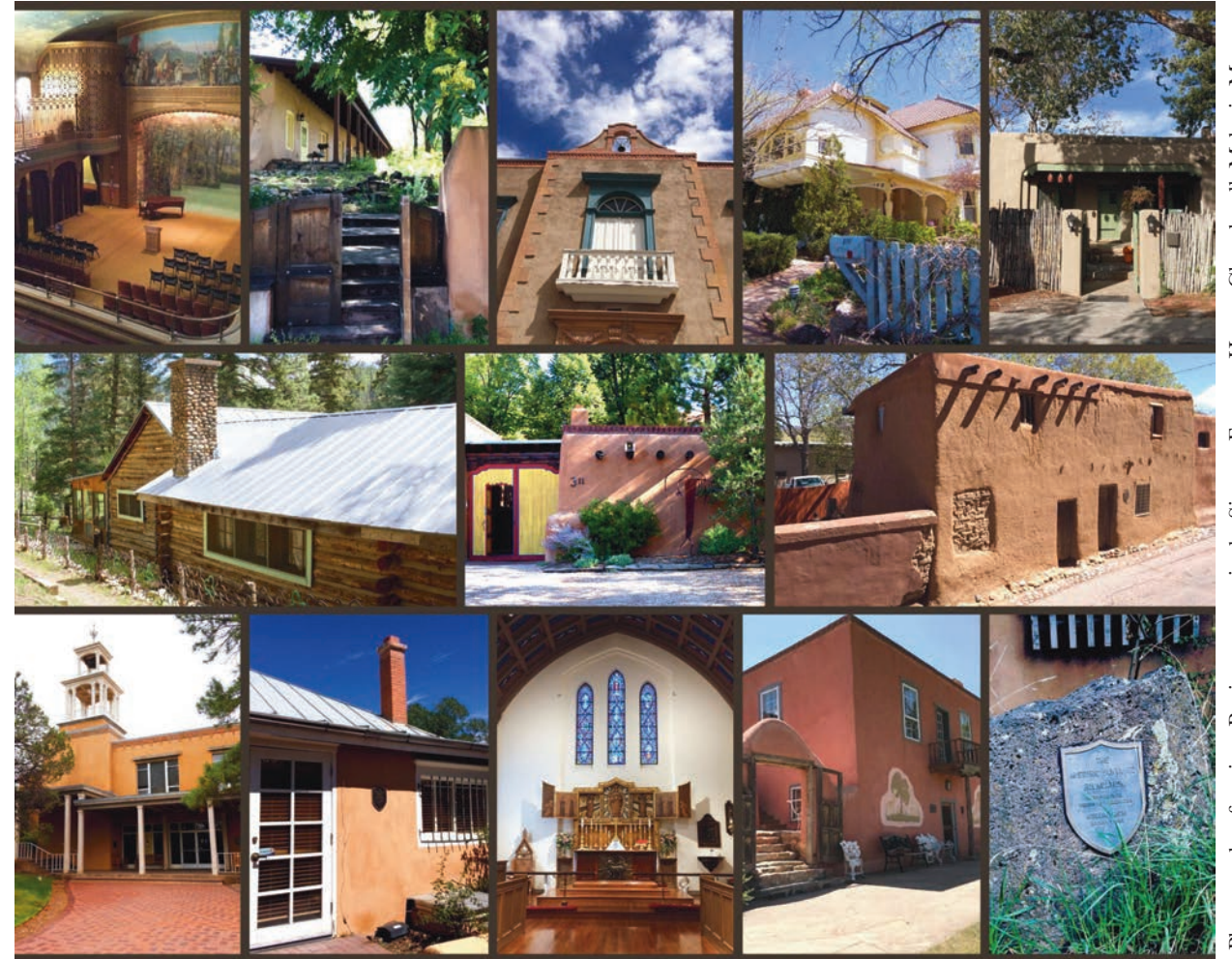
Photographs of various Register properties. Below: The Stone House.