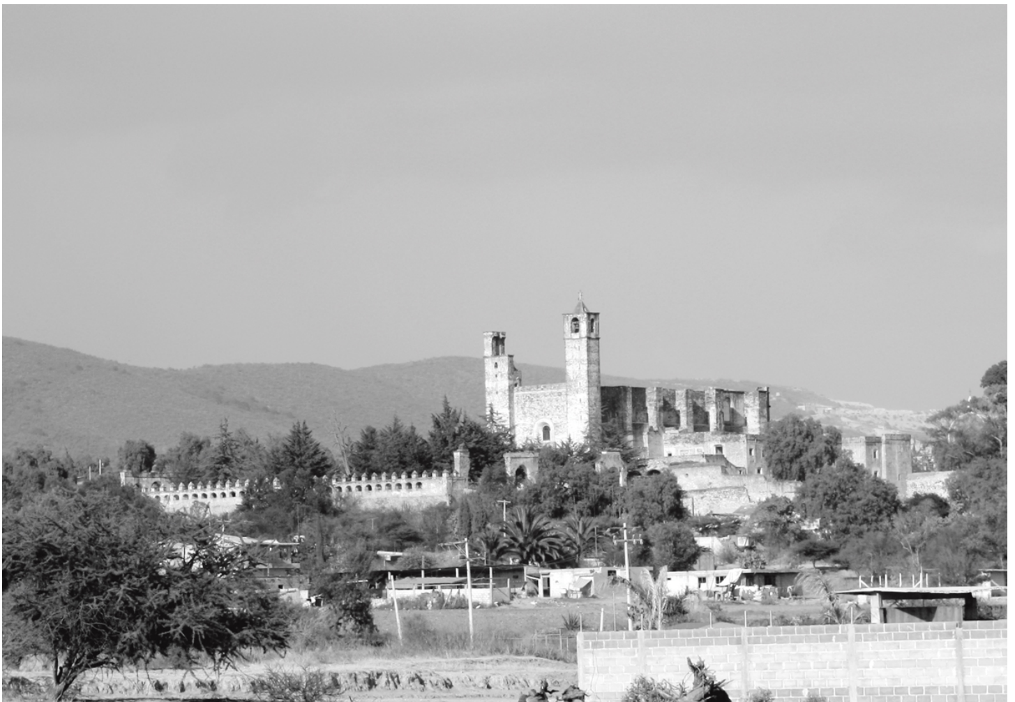
From Early Churches of Mexico: An Architect's View by Beverley Spears. Copyright © 2017 University of New Mexico Press, 2017.