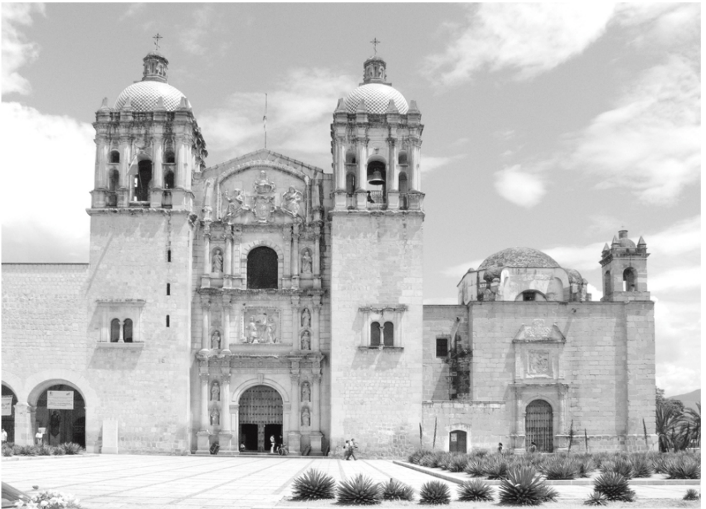
From Early Churches of Mexico: An Architect's View by Beverley Spears. Copyright © 2017 University of New Mexico Press, 2017.

The subject is Spanish colonial church design in Mexico, essentially from 1550s through the 1560s. Photos and history were gathered by Spears during visits to Mexico over a ten-year period on her visits to the source(s). "When time and circumstances permitted, I began to read about and seek out the old conventos....More than one hundred conventos still stand from the approximately three hundred that were built during the sixteenth century...." Spears here is seeking and seeing architecture as religious and social art.