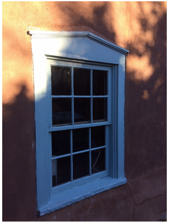
Photos, left to right: Entrance to Randall Davey Studio, Window at Olive Rush House