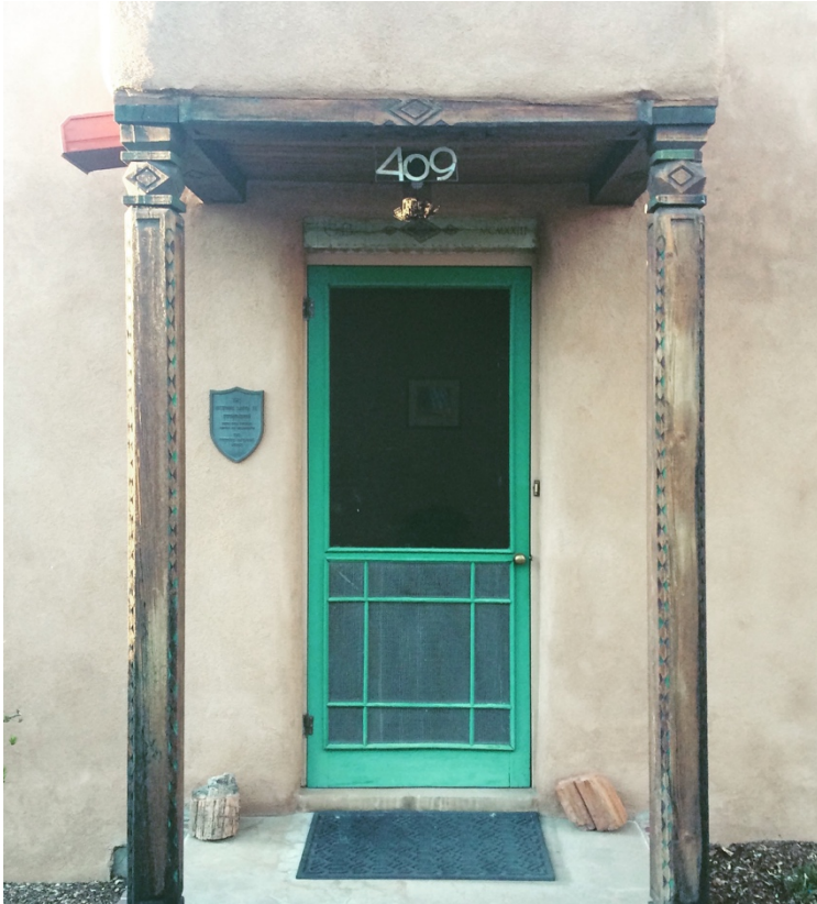
Front door of Gustave Baumann House