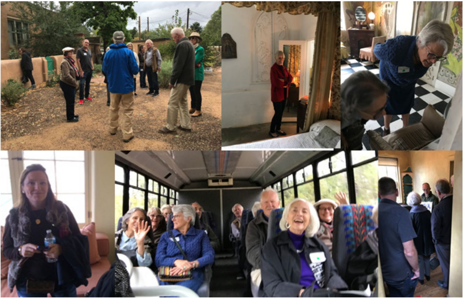
Participants on the 2018 Artists Homes Tour

shuttle driver for the afternoon. We are so grateful to the staff for thinking on their feet and for all their support.