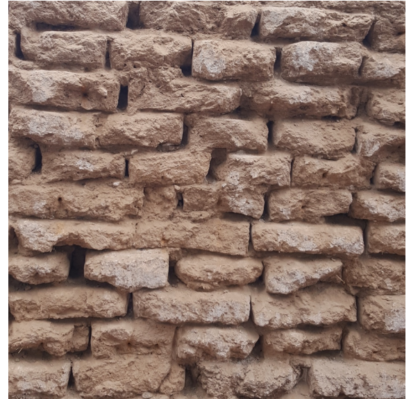
El Zaguán wall during renovations exposing the adobe bricks