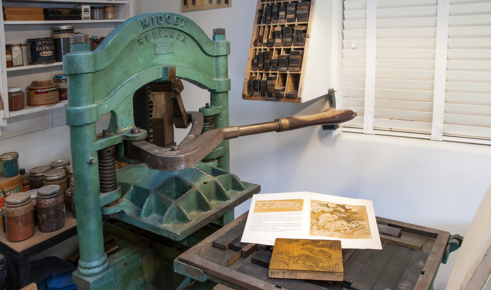
The Press of Gustave Baumann from New Mexico's Palace of the Governors: Highlights from the Collection