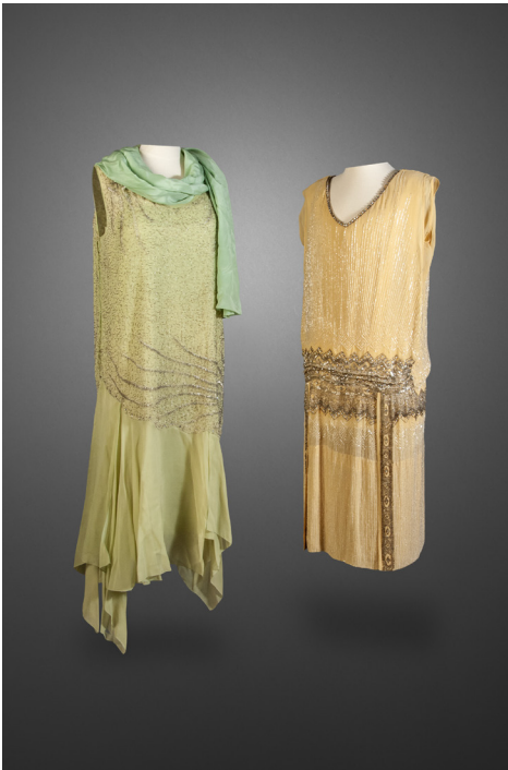
Flapper dresses