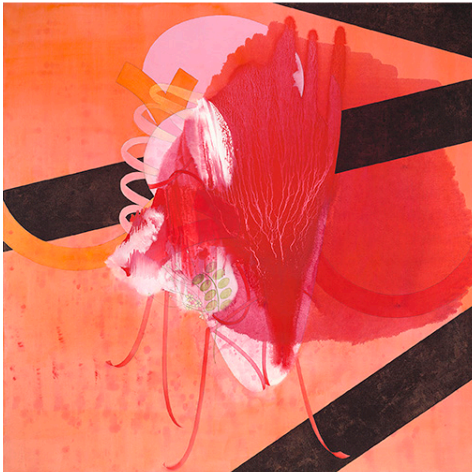
Arabian Jasmine, Painting